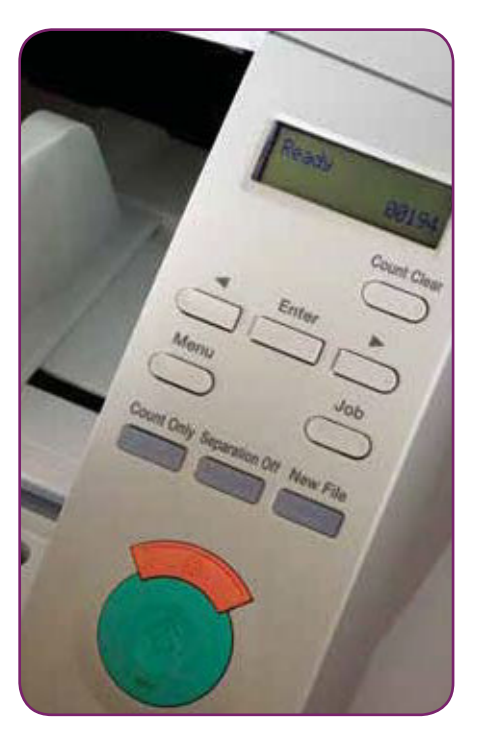
User-friendly control panel

Both the DR-G1130 and DR-G1100 come with an array of intelligent image processing features, including advanced deskew to straighten documents that are fed in at an angle, MultiStream to create dual image outputs for OCR applications and Character Emphasis to improve legibility for better OCR recognition.