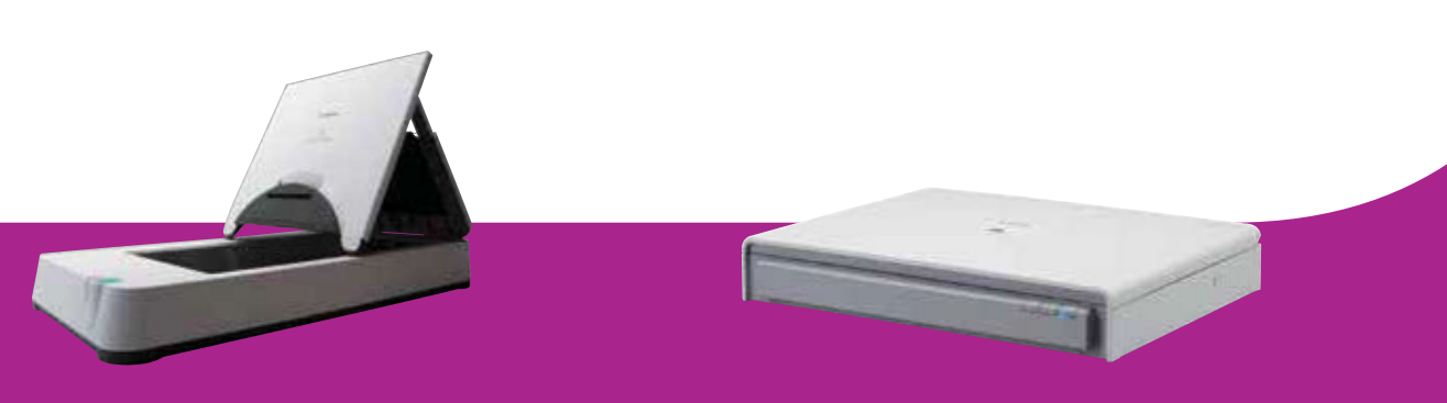
A4 Flatbed Scanner Unit 101

Scan bound books, journals and fragile media by adding the Flatbed Scanner Unit 101 for documents up to A4 or Flatbed Scanner Unit 201 for A3 scanning. Connected by USB, these flatbed scanners work seamlessly with the DR-G1130 and DR-G1100 in a smooth dual-scanning operation that lets you apply the same image-enhancement features to any scan.